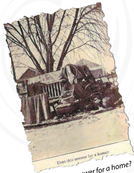
Does this answer for a home?

agency there than in the cities or more thickly settled villages... In rural communities, there is no police officer under salary... [R]espectable and law abiding persons do not dare to make complaint of a law breaker for fear that their barns... will be burned down. For these reasons... very serious wrongs have been allowed to continue for a long time." In rural areas, agents found cases of sexual abuse and incest, extreme poverty, abandoned children, and other alarming conditions.