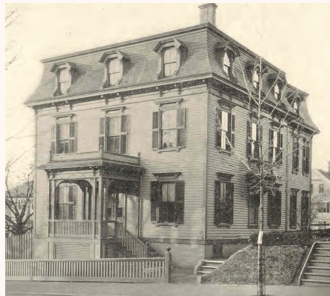
Doyle Avenue Home