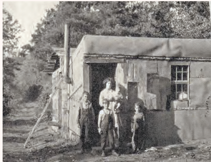
Where gifts to the Children's Fund can be used for good purpose by the RISPCC.