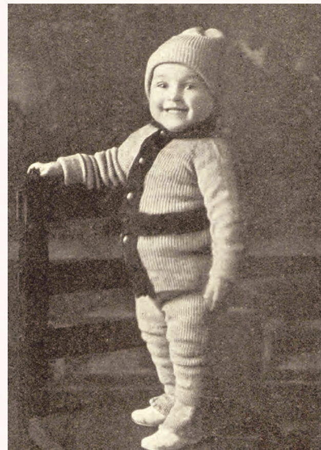
Jolly Little Fellow