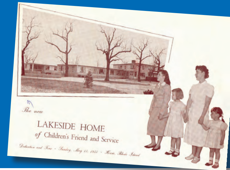
The new Lakeside Home.