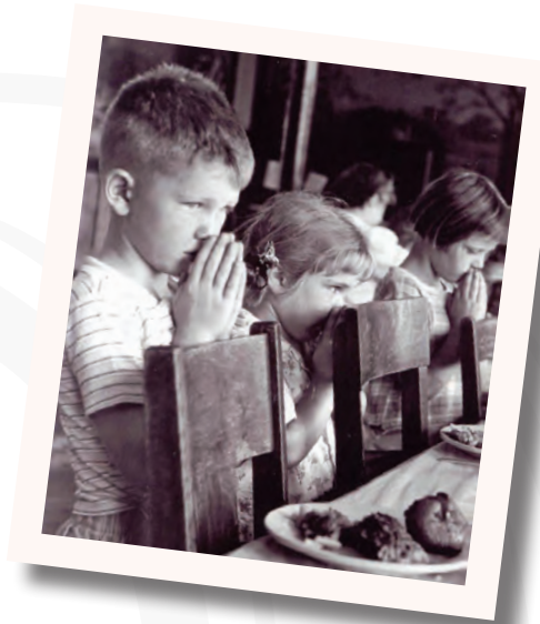
Children praying before meals at the Lakeside Home.