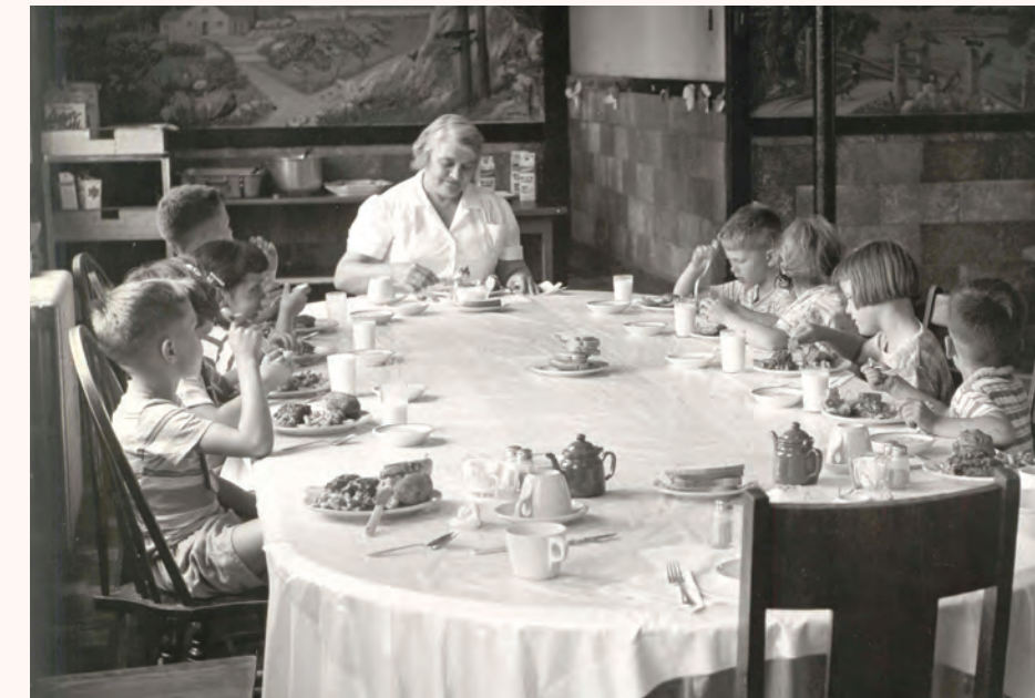
Dinner at the Lakeside Home.