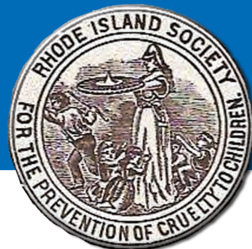
The Official Seal of the American Humane Association adopted by RISPC