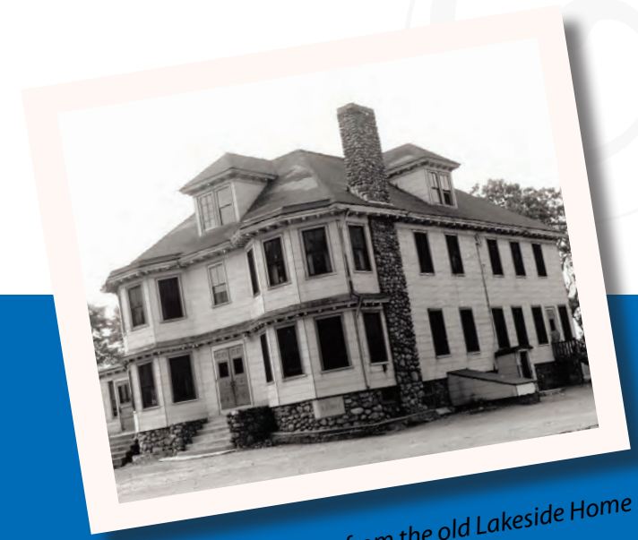
One of the buildings from the old Lakeside Home and Preventorium.

A community study suggested that the Lakeside property be converted into an emergency shelter or study home. A few years after the transfer, it became apparent that the facility was in serious disrepair. A new state-of-the-art facility was constructed in the mid-1950s.