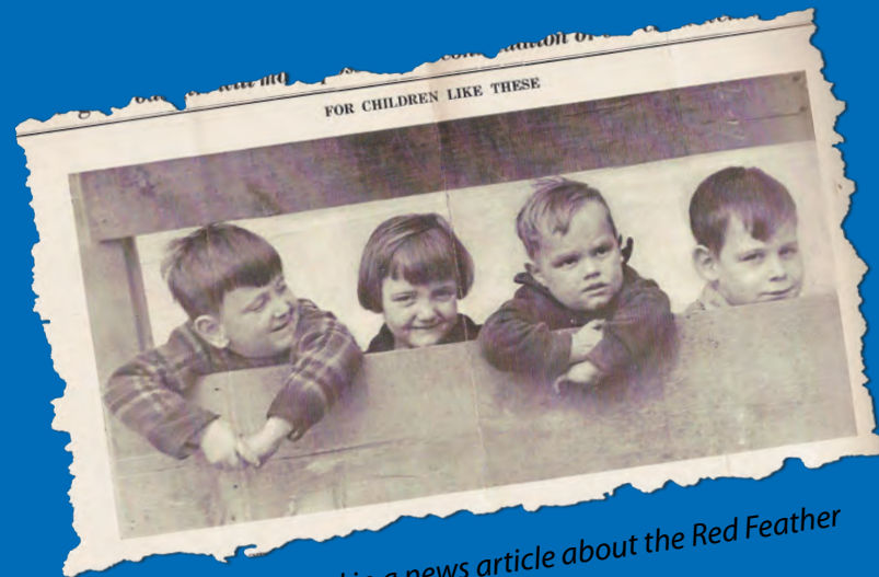
Children featured in a news article about the Red Feather Campaign.