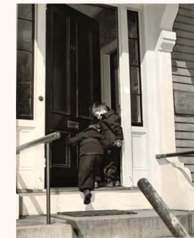
Children at the former Shelter for Colored Children.

In 1939, the Association asked Children's Friend to take the responsibility for finding homes for its children, and in 1940, Children's Friend employed a trained social worker to "study the needs of the Negro race" in Providence. In its annual report of 1941, the Board of the Association for the Benefit of Colored Children stated that members of the community - "three colored and three white members" - were appointed to the Case Committee, "this being the first time that any colored persons had actively participated in the work of the Shelter." In 1944, five African American members were elected to this Board.