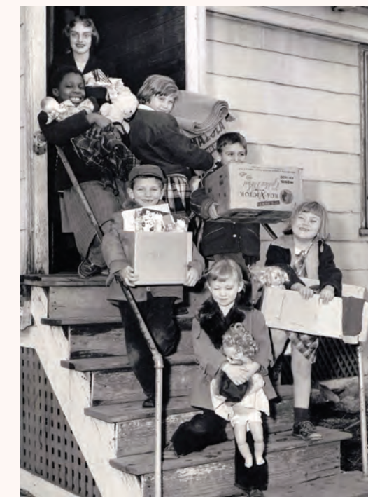
Moving day at the old Lakeside Home.