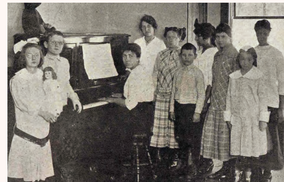
Children and staff at the piano in the Doyle Avenue Home.