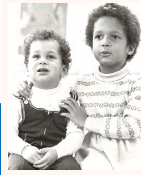
The changing face of children's needs.

The journey continues. As poverty and other circumstances continue to place children at risk, high-quality and effective services, such as those provided by Children's Friend, are badly needed. A strong focus on prevention and advocacy will help to eliminate the societal factors that threaten the well-being and healthy development of our youngest and most vulnerable children.