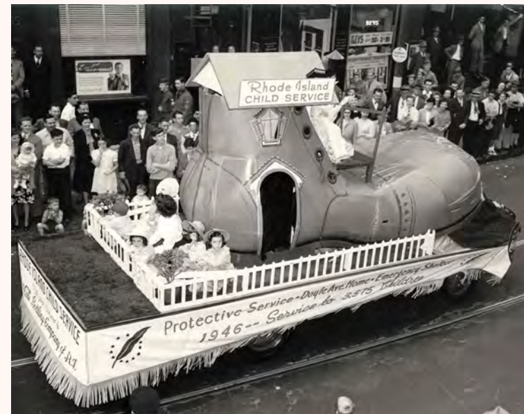
Fund raising float for the Red Feather Campaign.