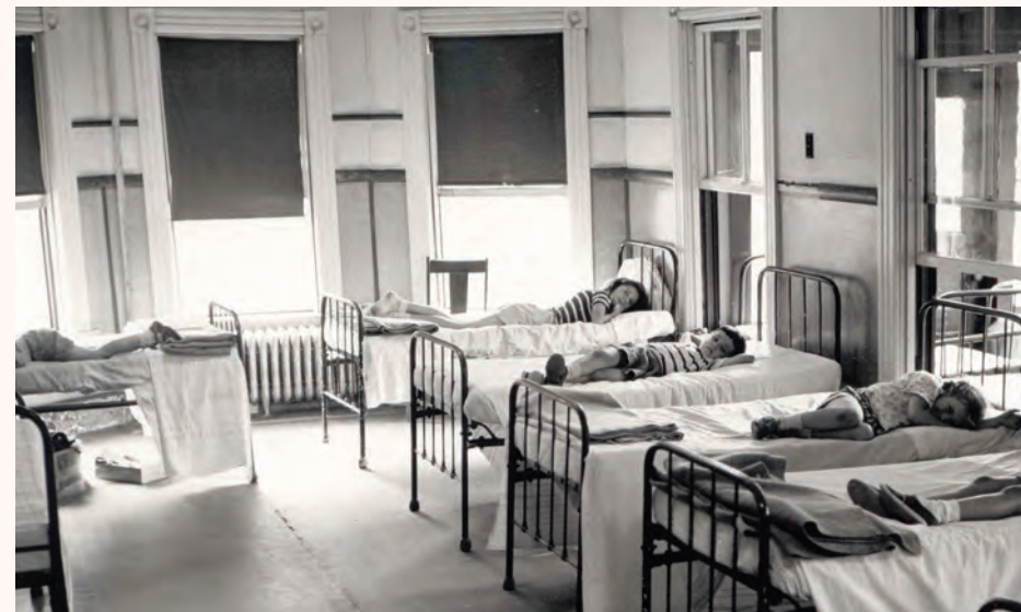
Beds with children at the Lakeside Home.