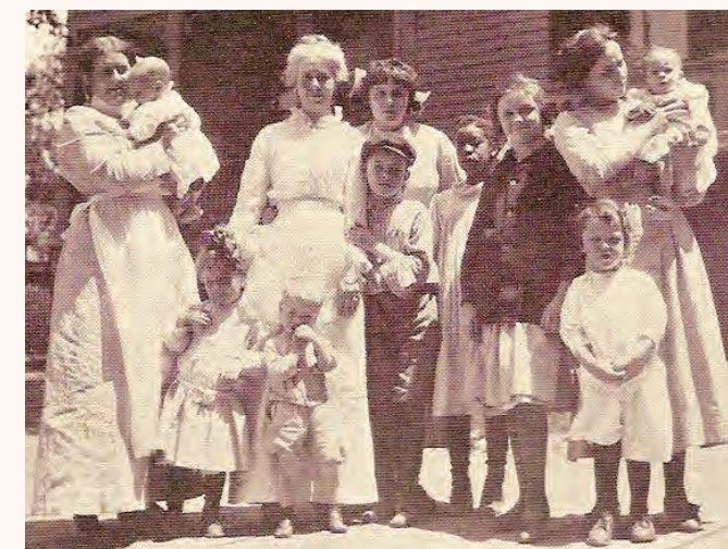
Children and staff at the Doyle Avenue Home.

As the agency continued its work, it developed a placing out program, putting children in the homes of private families. At one point, the social worker hired to administer this program had responsibility for over 500 children placed in the community.