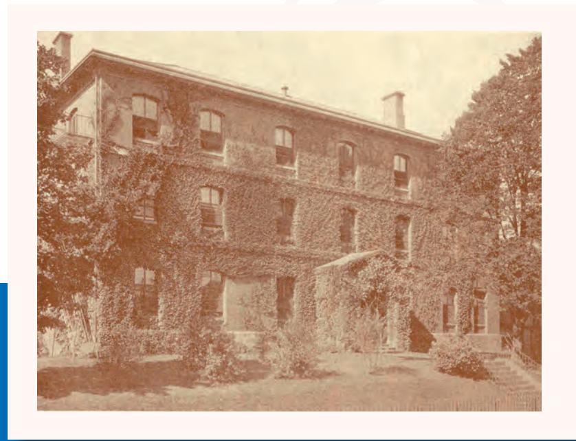
The Tobey Street Home, located in Federal Hill.

Closing its home on Tobey Street in 1926, the agency hired a staff trained in social work methods to undertake new directions in child welfare.