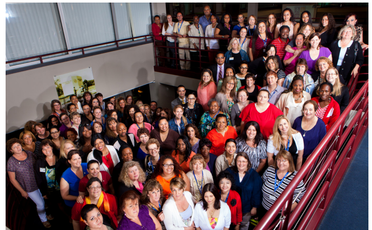
Pictured here are the 140 employees who received service awards. In this shot are veterans of five years, ten years, and fifteen years.